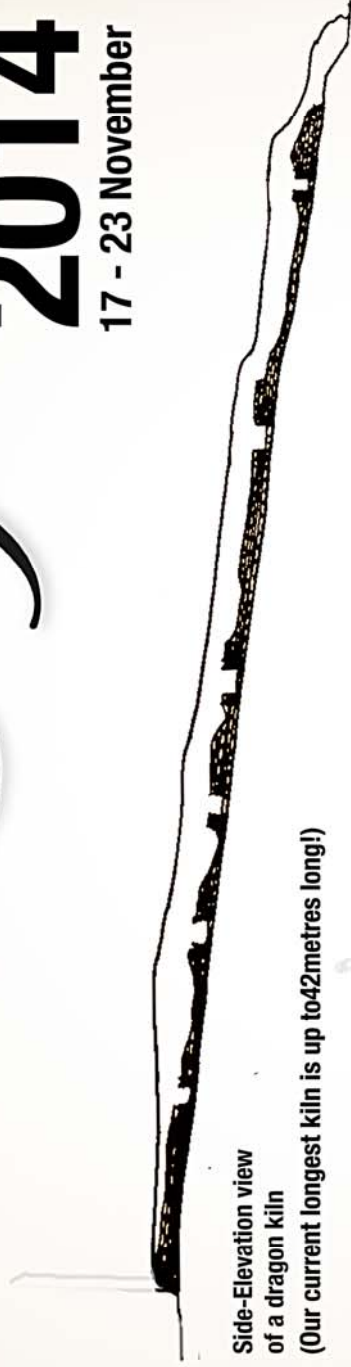
Side-Elevation view of a dragon kiln (Our current longest kiln is up to 42metres long!)